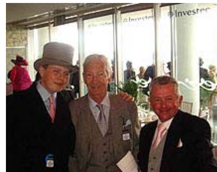
Muis Roberts with Lester Piggott & grandson

The boardroom hosted a full field of dignitaries – Muis Roberts flew in with us and I managed to get a photo of him with Lester Piggott and his grandson who was there with his father, William Haggas.