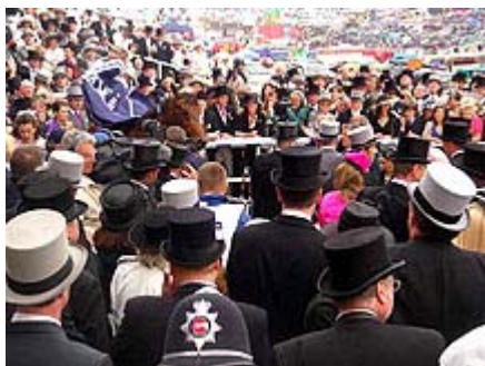
See The Stars in the winner's enclosure

I got back from that UK racing trip in buoyant spirit with the best intentions. No sooner was I home, then I had to fly to Durban for the Yearling sales and Vodacom July and came back to Cape Town with the most crippling bout of food poisoning – quite a few of our pals suffered the same affliction this year – a few even went to hospital. The effect was doubly bad for me as the breeding season was about to start. We had three new stallions being syndicated – no sooner was that done, then we had to go to Jhb for the 2yo sales and I came back to prepare a power point presentation for a promo trip to Korea. Time just simply ran out!