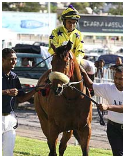
The Cardinal - Mauritian Horse of the Year, Champion 4yo and Champion Sprinter