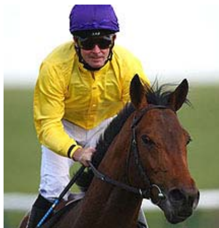
See The Stars