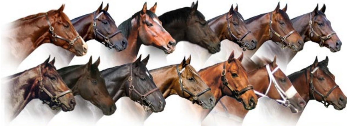
JALLAD JAY PEG LITHUANIAN LONDON NEWS MANSHOOD REBEL KING TAMBURLAINE

As an update to the newsletter we sent yesterday I thought I should share with you two items about AP Indy which make interesting reading. One from the current edition of Pacemaker & the other from Bloodhorse.com – see below: